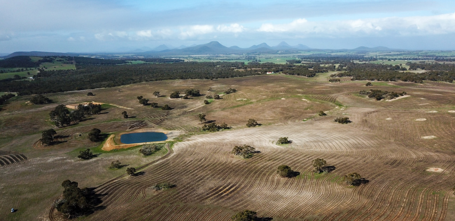
Planting mixed native species at Sukey Hill.