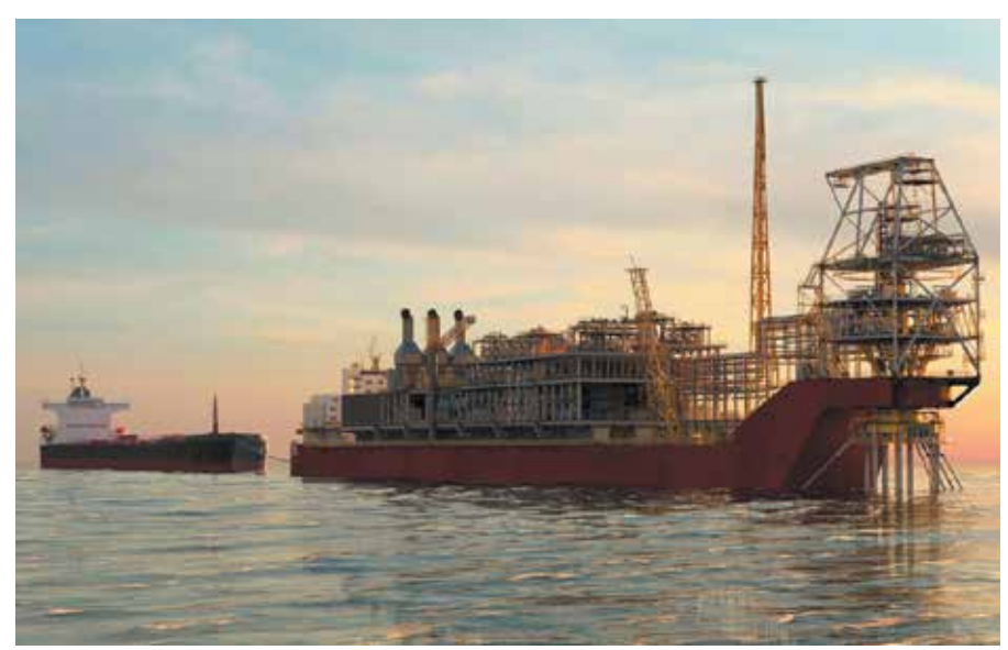
Artist impression of the FPSO for the Sangomar Field Development offloading oil to an offtake tanker.

The development includes the installation of a stand-alone floating production storage and offloading (FPSO) facility and subsea infrastructure that will be designed to allow subsequent development phases.