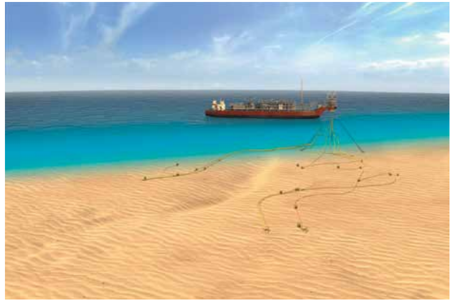
Artist impression of the FPSO connected through risers to the network of flowlines and subsea infrastructure.