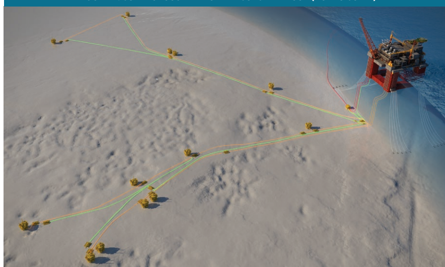
FIGURE 1: SCARBOROUGH INDICATIVE SUBSEA LAYOUT (NOT TO SCALE)

For more information, visit woodside.com.au/our-business/burrup-hub